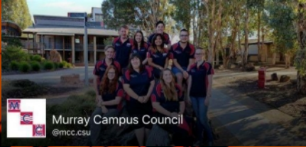
Murray Campus Council @mcc.csu