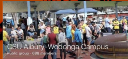
CSU Albury-Wodonga Campus Public group · 688 members