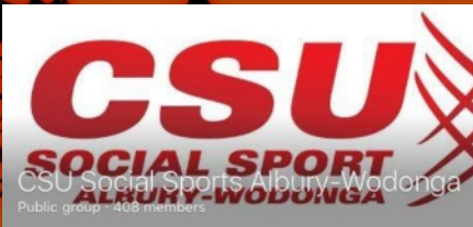
CSU Social Sports Albury-Wodonga Public group · 408 members