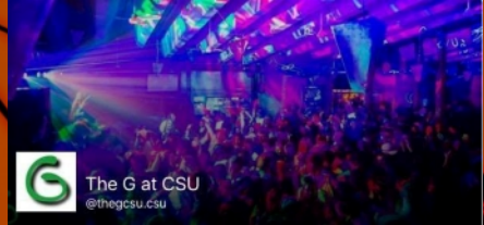
The G at CSU @thegcsu.csu