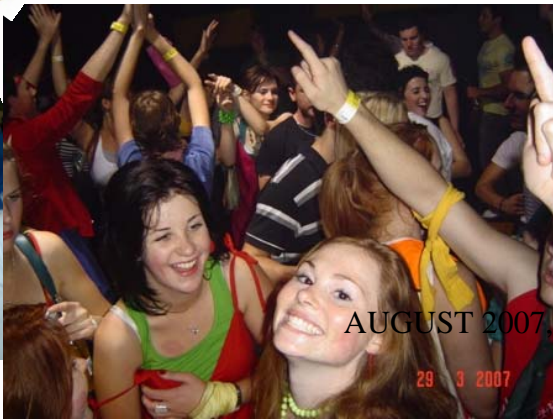
AUGUST 2007 EDITION ONE