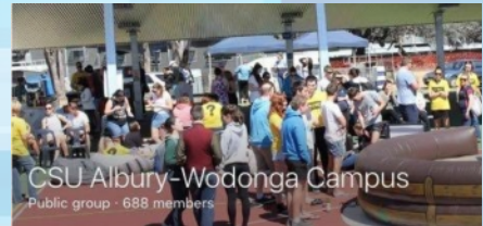
CSU Albury-Wodonga Campus