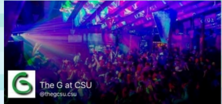
The G at CSU