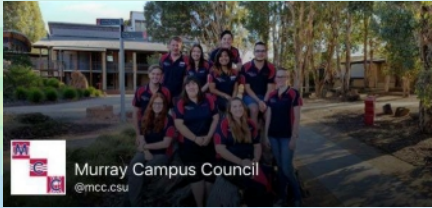
Murray Campus Council