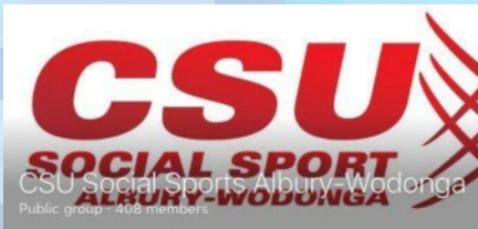
CSU Social Sports